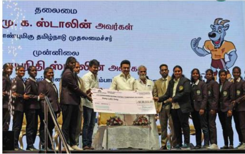
Richly deserved: Chief Minister Stalin presents a cheque for ₹60 lakh to the victorious football team as Sports Minister Udhayanidhi and HR&CE Minister Sekar Babu look on.

When asked about the government's efforts to provide jobs to the players, an SDAT official said: "Once the players apply for jobs, their applications will be processed based on the existing government orders."