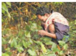
Traditional knowledge: A tribal harvesting Arogyapacha leaves from a forest in Kerala.

The Biological Diversity (Amendment) Bill, 2021 seeks to exempt registered AYUSH medical practitioners from intimating biodiversity boards before accessing biological resources