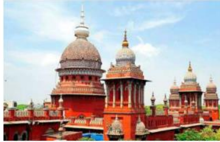
The judges also appreciated a committee chaired by an Additional Director-General of Police in the CB-CID for having come up with a draft digital evidence manual.