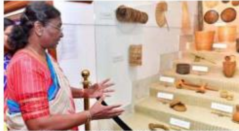
New beginning: President Droupadi Murmu inaugurating the Tribal Arts gallery in New Delhi on Tuesday.

The gallery showcases different themes such as